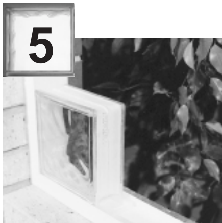
Place the first row of glass blocks in the frame sill, supporting and spacing each block with a "T" connector.