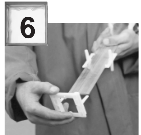
Snap the required amount of "X" connectors onto the stiffener bar and one "T" connector on each end.