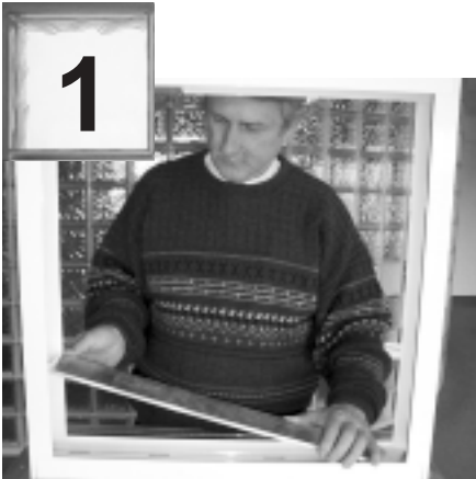
Place sill infill in bottom of frame.