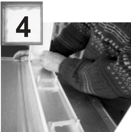
Place a cut "T" connector in the bottom corners of the frame on top of the sill infill, with the open end against the expansion material.