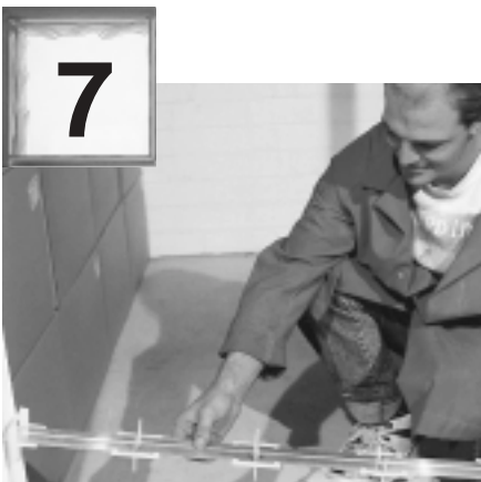
Place the stiffener bar, with connectors, onto the first row of glass blocks.