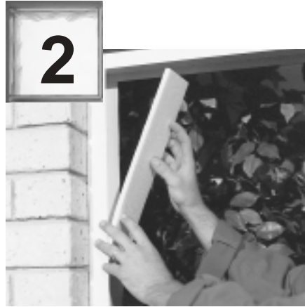
Place the Ezylay expansion material in both verticals of the Ezylay frame ensuring it extends from top to bottom.