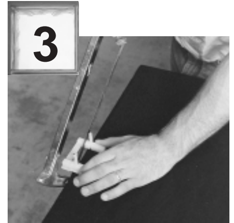
Cut the two "T" connectors where indicated as per diagram.